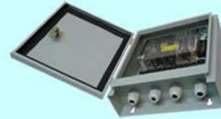
1. IPX67 Waterproof Connector