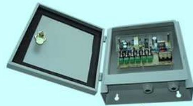
1. IPX67 Waterproof Connector